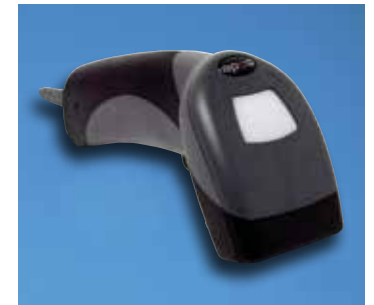
Bar Code Scanning Enjoy the advantages of scanning – speed of service, price control, item movement reporting and labor savings.

Secure Connector Panel A combination of 3 Serial, 1 USB and 1 Ethernet port are hidden behind a convenient, easy to access door located on the back of the unit.